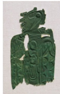
Copper, 16 x 10" WU 3686