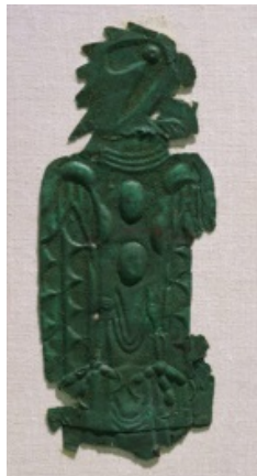
Copper, 11 1/4 x 4 1/2" WU 3684