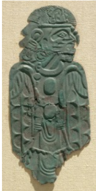
Copper, 12 x 5 5/8" WU 3679