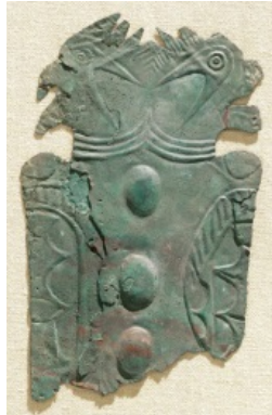
Copper, 10 1/2 x 6 9/16" WU 3680