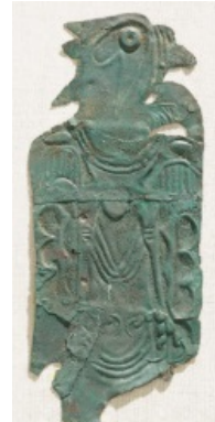
Copper, 12 1/4 x 5 1/4" WU 3682