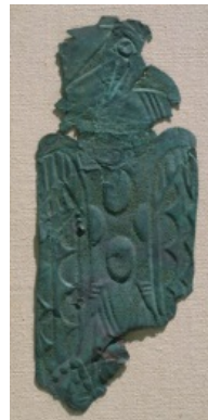
Copper, 16 5/8 x 9 1/4" WU 3685