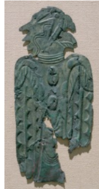
Copper, 13 1/4 x 5 15/16" WU 3681