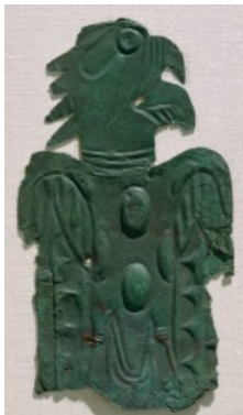
Copper, 10 1/8 x 5 9/16" WU 3683